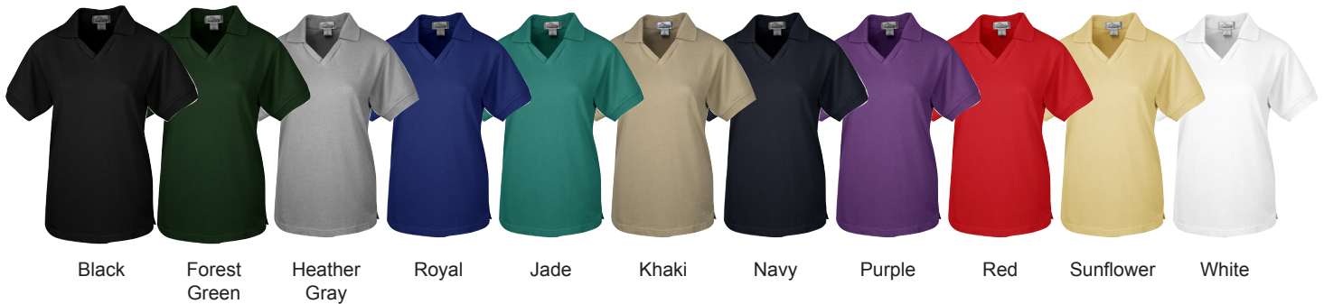
Black Forest Green Heather Gray Royal Jade Khaki Navy Purple Red Sunflower White