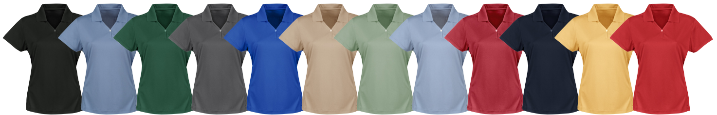
Black Columbia Blue Forest Green Gray Royal Khaki Kiwi Light Blue Maroon Navy Papaya Red