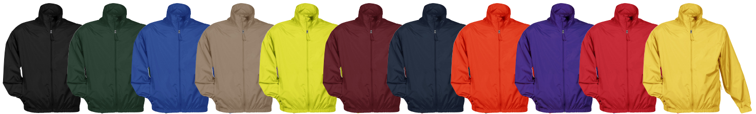
Black Forest Green Royal Khaki Lime Green Maroon Navy OSHA Orange Purple Red Yellow Gold