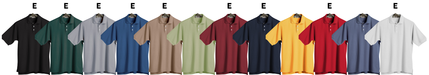
Black Forest Green Heather Gray Royal Khaki Kiwi Maroon Navy Papaya Red Slate Blue White