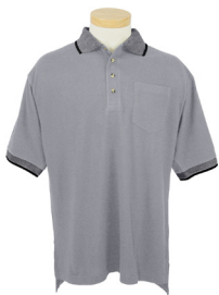
Heather Gray/ Black