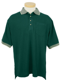
Forest Green/ Khaki