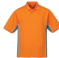
Orange/ Charcoal/ White