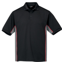
Black/ Charcoal/ Red