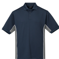
Navy/ Charcoal/ White