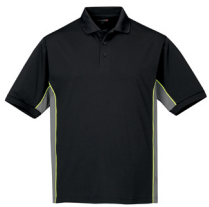
Black/ Charcoal/ Lime