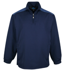
Navy/ Mountain Blue