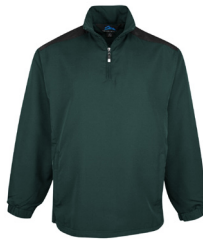
Forest Green/ Black