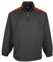
Charcoal/ Burnt Orange