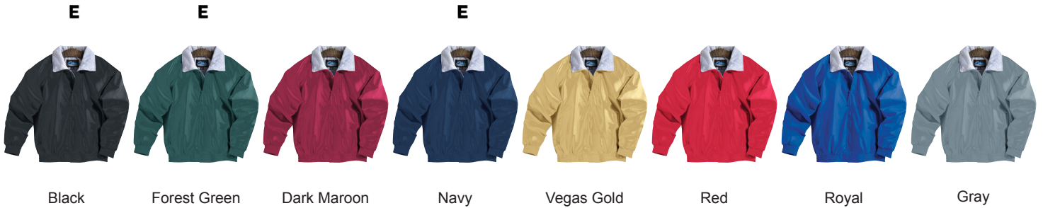
Black Forest Green Dark Maroon Navy Vegas Gold Red Royal Gray