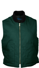
Dark Forest/ Black