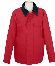
Red/ Black/ Black