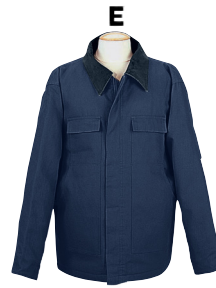
E Navy/ Navy/ Black