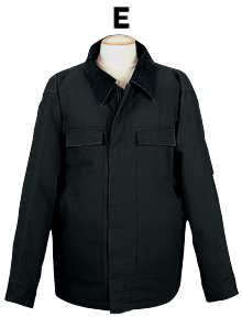
E Black/ Black/ Black