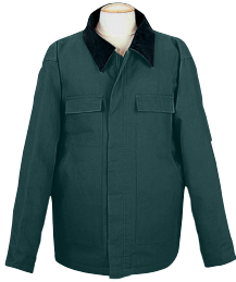
Dark Forest/ Black/ Black