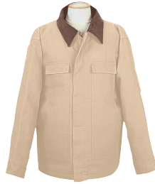
Wheat/ Brown/ Wheat