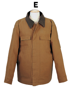
E Spice/ Brown/ Black