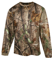
Mossy Oak® Infinity®