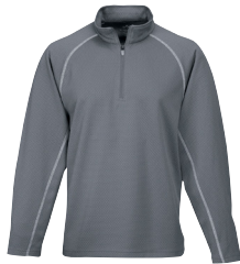
Gray/ Light Gray