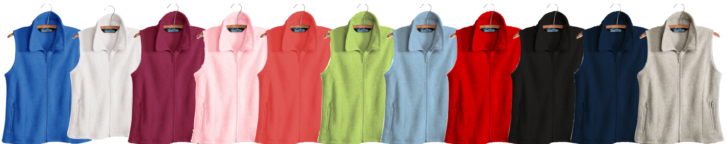
Imperial Blue Marshmallow Raspberry Light Pink Coral Pear Pale Blue Red Black Navy Oatmeal