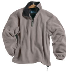
Heather Gray/ Black