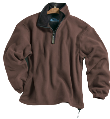
British Tan/ Black