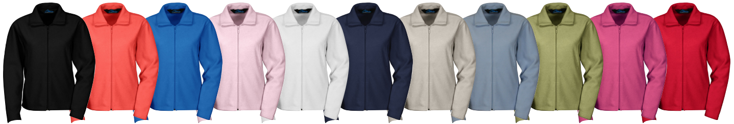
Black Coral Imperial Blue Light Pink Marshmallow Navy Oatmeal Pale Blue Pear Raspberry Red