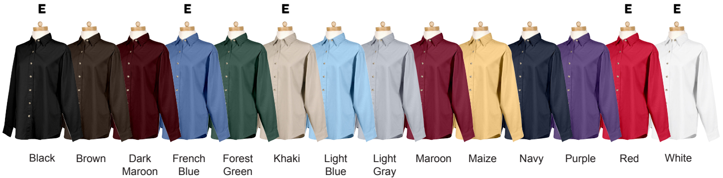
Black Brown Dark Maroon French Blue Forest Green Khaki Light Blue Light Gray Maroon Maize Navy Purple Red White