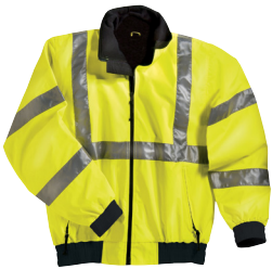
LIME GREEN/ BLACK