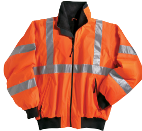
OSHA ORANGE/ BLACK