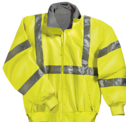
LIME GREEN/ GRAY