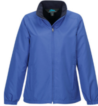
Imperial Blue/ Navy