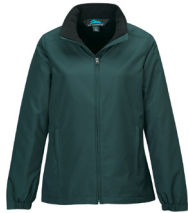
Forest Green/ Black