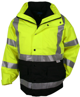
LIME GREEN/ BLACK