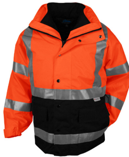
OSHA ORANGE/ BLACK