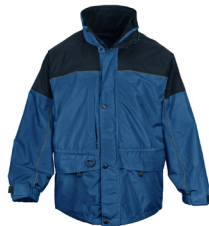
Imperial Blue/ Navy