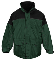
Forest Green/ Black