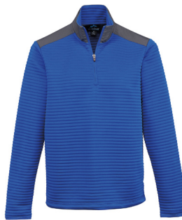
SKYDIVER BLUE/ GRAY