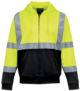
LIME GREEN/ BLACK