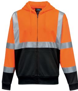
OSHA ORANGE/ BLACK