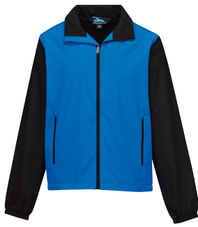
BRILLIANT BLUE/ BLACK