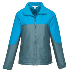
Mountain Blue/ Turquoise