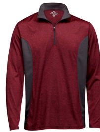
Deep Razz/Dark Gray