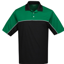
Kelly Green/ Black