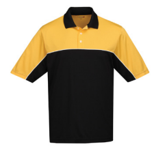
Yellow Gold/ Black