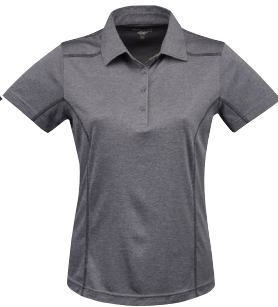
HEATHER CHAR- COAL/BLACK