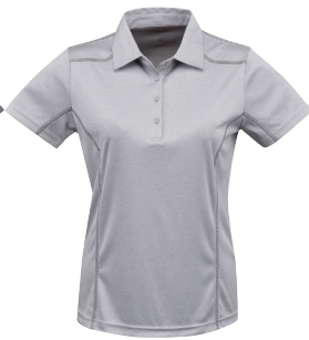
HEATHER GRAY/ DARK GRAY