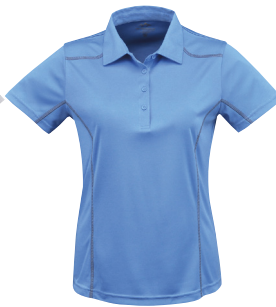
PROVENCE BLUE/ DARK GRAY