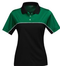
Kelly Green/ Black