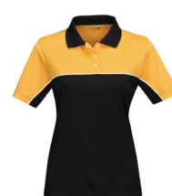
Yellow Gold/ Black