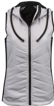
LIGHT GRAY/ BLACK