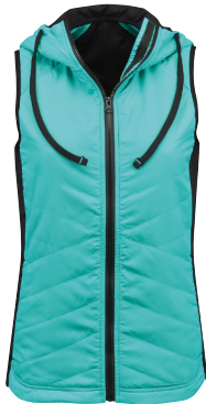
GREEN AQUA/ BLACK