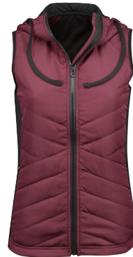
DARK MAROON/ BLACK